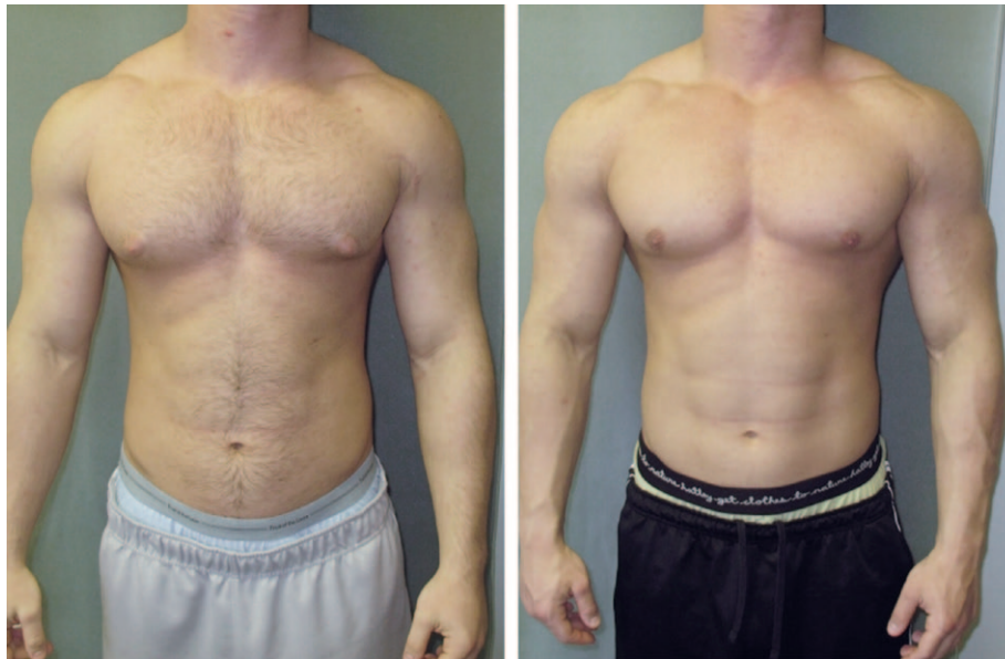
Fig. 4. (Left) A 25-year-old bodybuilder, 6 feet 0 inches tall and weighing 230 pounds, presented with moderate gynecomastia present since his early teenage years. His gynecomastia became more pronounced after he began his bodybuilding career with 9 percent body fat. Antiestrogen therapy was unsuccessful. (Right) The 6-month postoperative view demonstrates excellent chest contour with inconspicuous scars after a 1-inch incision in the infraareolar region. Surgical excision was performed without liposuction. The right breast specimen weighed 5 g and measured 2.9 \times 2 \times 0.5 cm. The left breast specimen weighed 7.5 g and measured 3.9 \times 2.9 \times 0.5 cm.