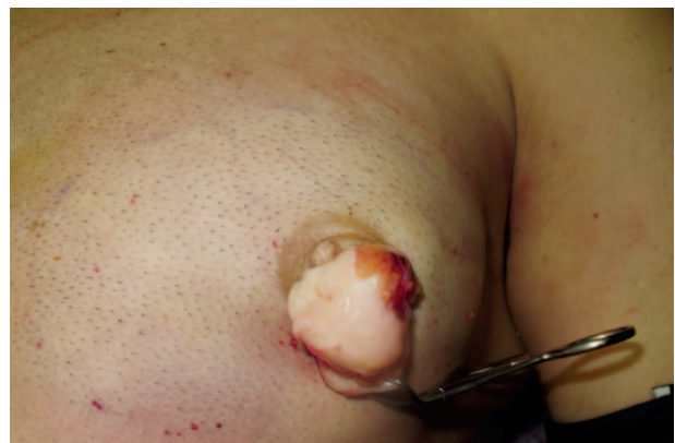
Fig. 1. Intraoperative view of the gynecomastia tissue dissected out sharply with the use of a blade and a piercing towel clamp.