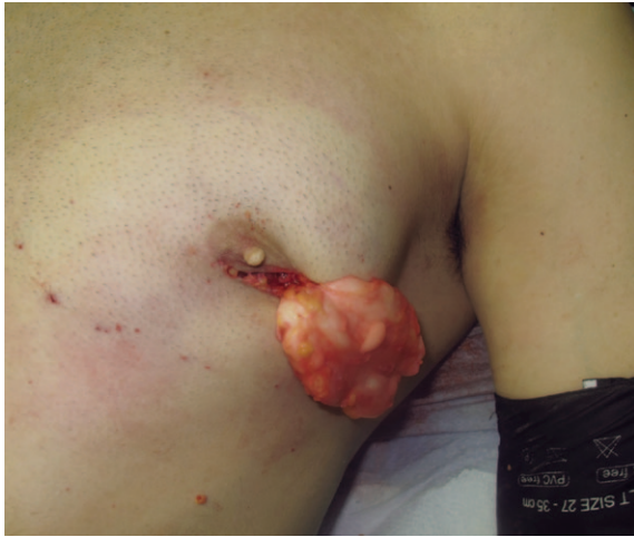
Fig. 2. Complete excision of the gynecomastia tissue demonstrating the fibrous consistency of the specimen.

patients with mediocre physique. Professional body builders have a much higher ratio of glandular to fatty tissue and required no liposuction in this study. In virtually all cases, a subcutaneous mastectomy was performed, leaving behind only 2 to 3 mm of tissue under the skin. In this manner, the nipple-areola complex was flush with the contour of the pectoral muscle.