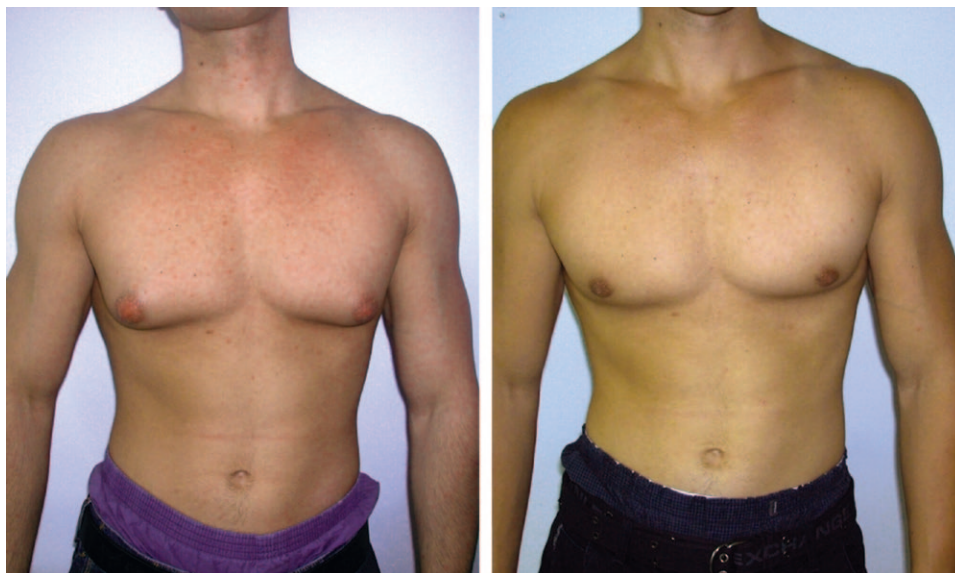
Fig. 3. (Left) A 30-year-old body builder, 5 feet 10 inches tall and weighing 200 pounds, with severe true gynecomastia resistant to antiestrogen medications after taking prohormones 4 years before presentation. (Right) Eight-month postoperative view. The glandular excision was performed through a 1-inch infraareolar incision. A minimal amount of adipose tissue was excised. No liposuction was used.

In the management of postoperative hematomas, control of a single bleeding vessel resulted