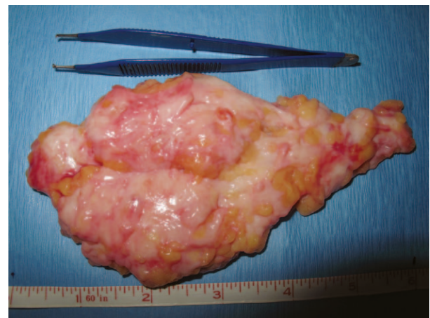
Fig. 6. A specimen collected after surgical excision of gynecomastia from a bodybuilder. The specimen demonstrates the high glandular content of the tissue with its distinct shape of a head, body, and tail.

In general, unsatisfactory results following the use of liposuction in gynecomastia patients may relate to the inadvertent sharp penetration of the pectoralis muscle fascia. When the fascia's